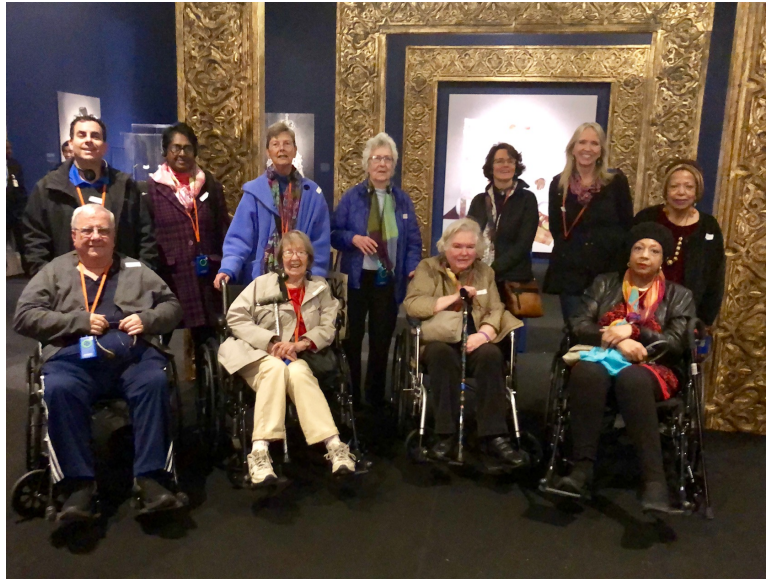
Members and volunteers enjoying the latest exhibit at the Legion of Honor.

We look forward to a New Year full of new friendships and fun times together!